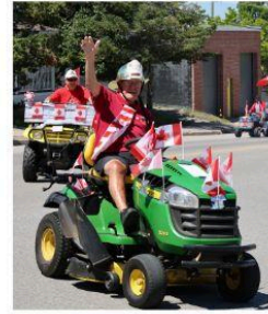
Photo highlights from the 2026 Tay Canada Day Parade