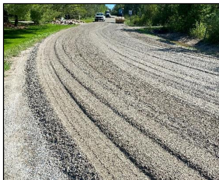
Fresh gravel and beginning of fine grading on Bass Bay Road, Victoria Harbour