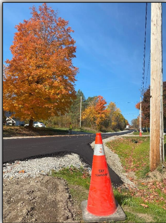
Asphalt and gutter on Ninth Avenue, Port McNicoll prior to shouldering

Paving began on October 9, 2024 and finished November 19, 2024.