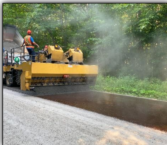
Tac coat application and beginning of double surface treatment on Fesserton Sideroad in rural Tay