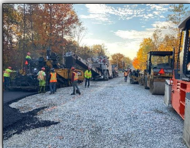
Paving on fine graded road base at Ninth Avenue turnaround, Port McNicoll