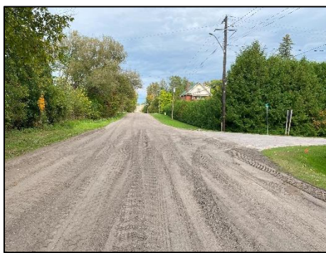
Post pulverizing on Alberta Street, Port McNicoll