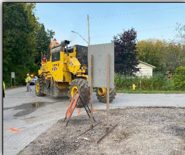
Pulverizing Percy Street, Waubashene