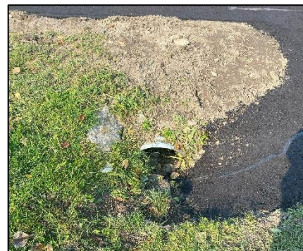
Asphalt Gutter prior to shouldering on Veterans Drive, Victoria Harbour